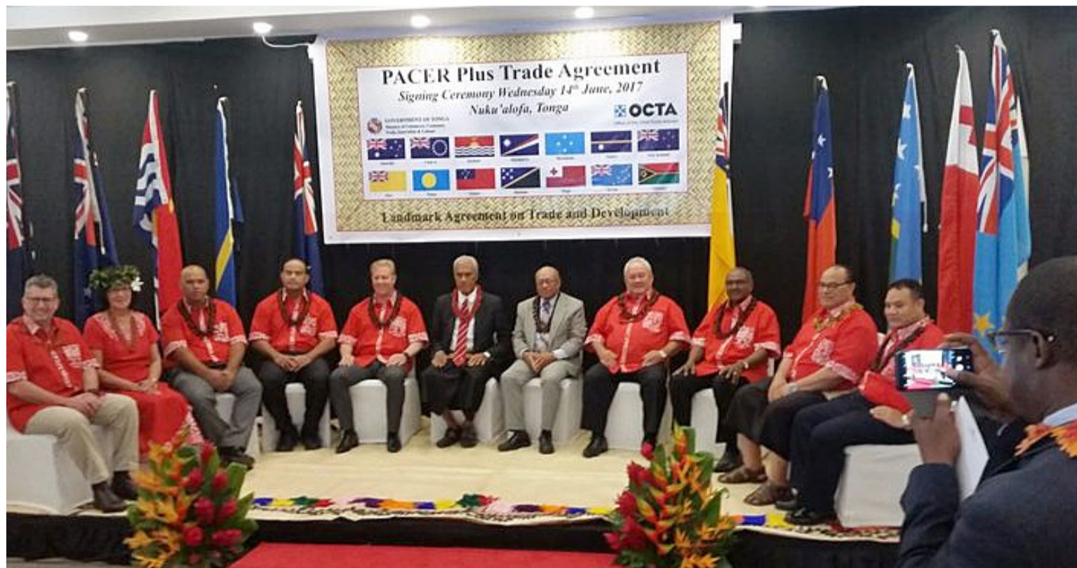
"The PACER Plus agreement has been in discussion between Australia and New Zealand and the Pacific since August 2009."

"Within the next 25 years, the agreement will lower the costs of tariffs of imported goods into Samoa as well," she added. One such spin-offs