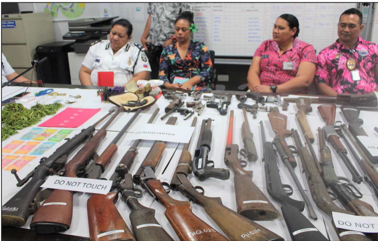
56 illegal firearms and unregistered weapons not included ammunition are in Police possessions

The present Gun Amnesty ends of New Year’s Eve.