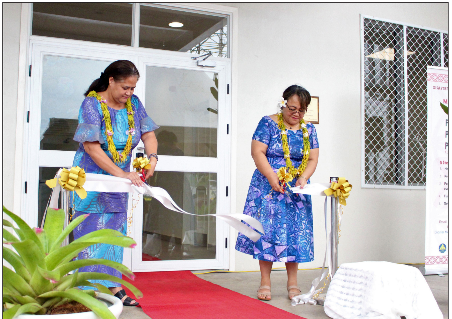
O'otina aloaia o le lipine mo le tatalaina aloaia o le Ofisa Autu Fou a le NEOC.

O lenei galuega tele sa galulue fa'atasi le Matagaluega o Punaoa Fa'alavenatura ma le Si'osi'omaga (MNRE), Matagaluega o Tupe (MOF) ma le Matagaluega o Galuega, Felau'iga ma Atina'e Tetele (MWTI).