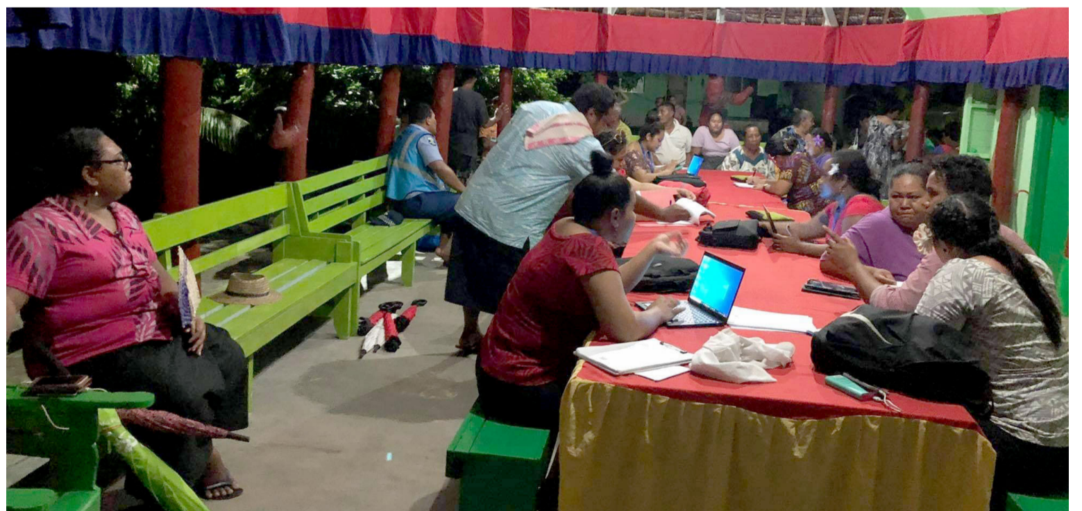
Fa'agasolo ai o galuega a le Ofisa o Fuainumera Faamaumauina.

"O aiga na lea ua toe aga'i i ai le aufaigaluega, ae afai e lē maua, o lona uiga o i latou uma na e tatau ona aga'i ane i nofoaga ua saunia e le Ofisa