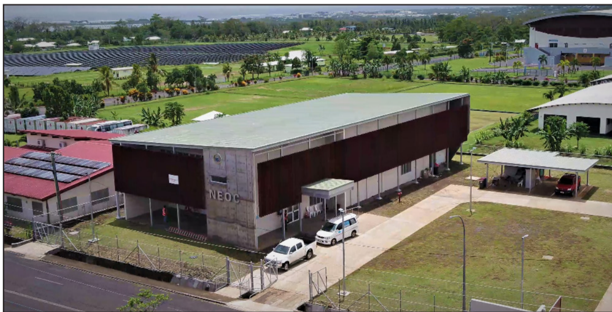
“The $6.4million tala NEOC center is a state of the art infrastructure fitted with its own independent communications network, water supply, back up generator and working facilities.”