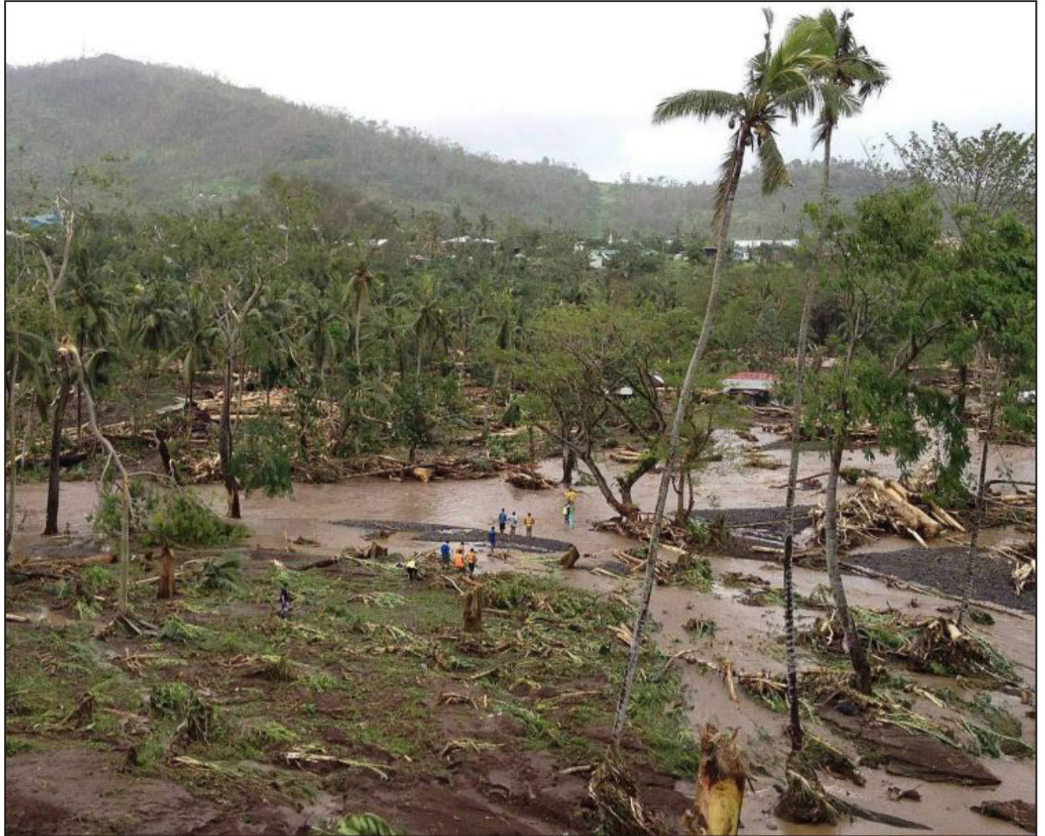
"The aftermath of Cyclone Evan in 2012. The Pacific is predicted to see at least 6 or up to 8 cyclones this cyclone season."

Maybe some time sooner we could have a more detailed report as the month's progress.