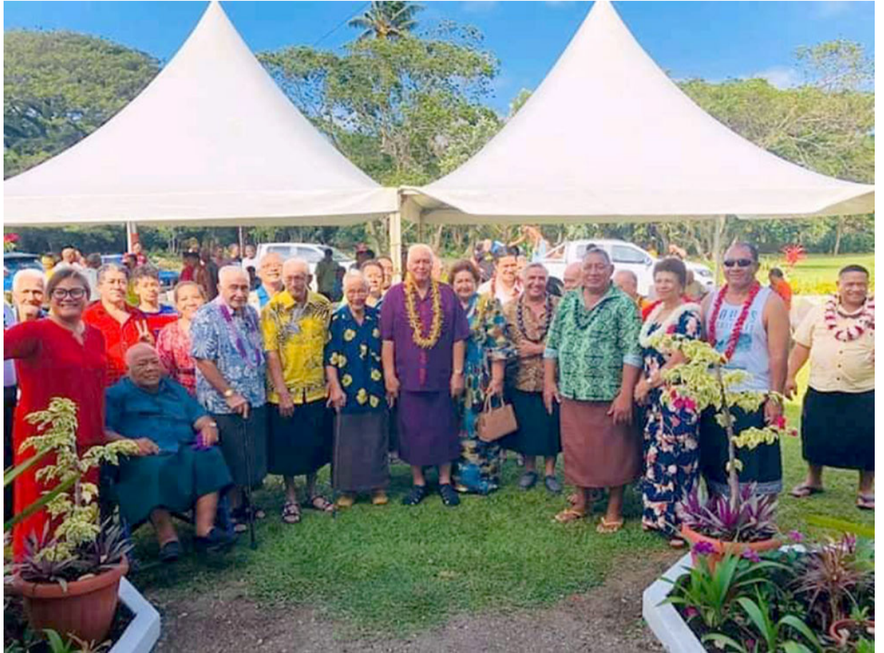
Afioga i le Ao Mamalu o le Malo Tuto'atasi o Samoa, lana Masiofo ma le Paia o le Afio'aga o Vailele Tai.

O le tali fa'aaliali fo'i lea, o le lagolagosua malosi a le Afio'aga o Vailele Tai i le fa'amoemoe a le Malo o lo'o taumafai nei, ina ia ta'imua le Pulega mamalu