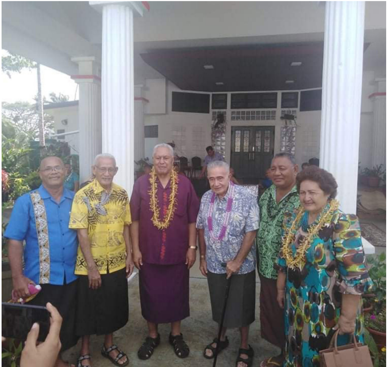
Lana Afioga i le Ao Mamalu o le Malo Tuto'atasi o Samoa ma lana Masiofo fa'apea nisi o Sui o le Afio'aga o Vailele Tai i la latou feiloa'iga i le Maota o lana Afioga i le Ao o le Malo i Vailele Tai.

a ali'i ma faipule, e puipua le nofolelei, saogālemu ma le fealofani o tagata uma.