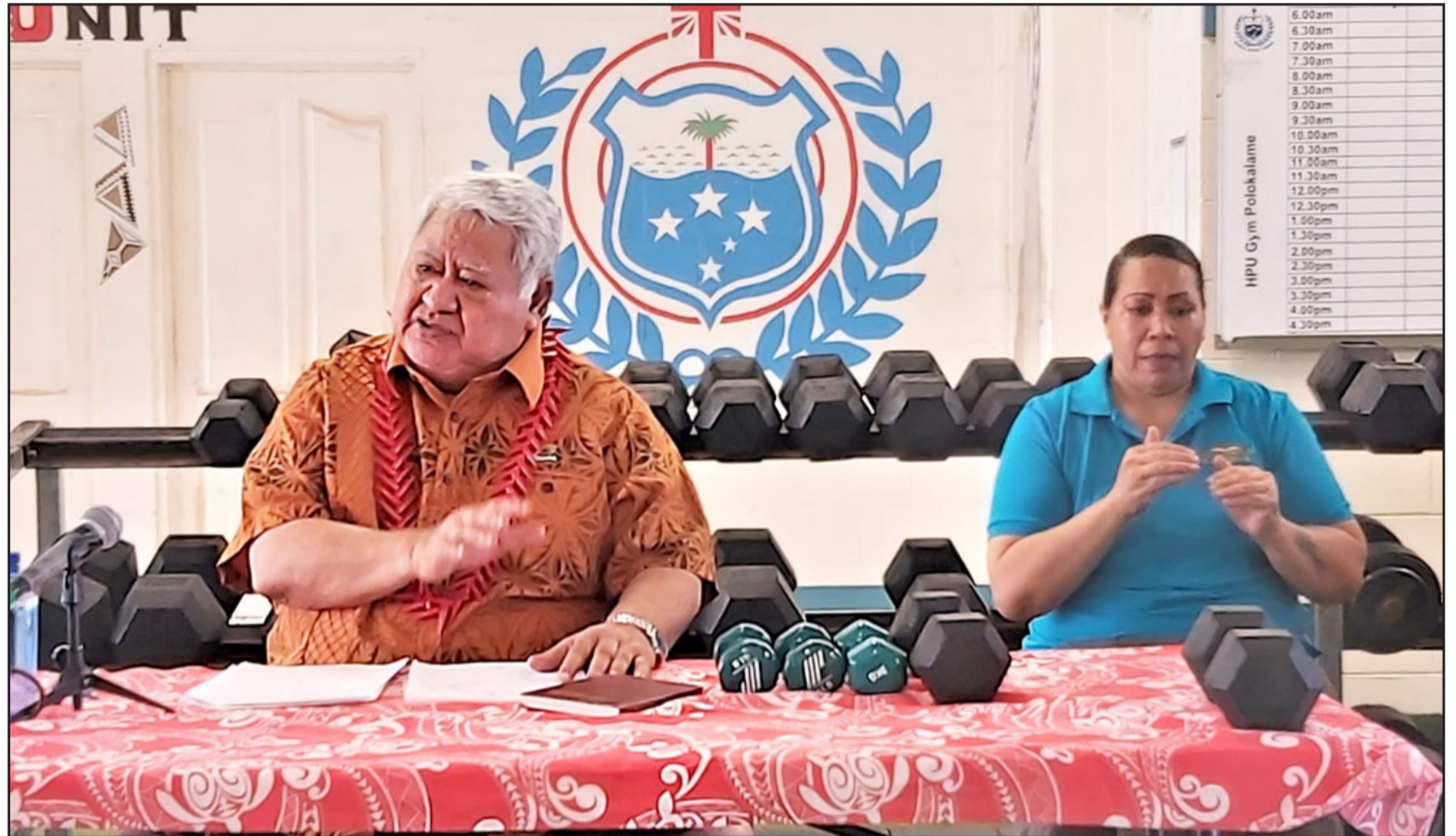
Prime Minister Tuilaepa Dr. Sailele Malielegaoi in the move Saturday at the Samoa Rugby Union Headquarters Tu’anaimato with Taimi ma le Palemia weekly interview with TV1 (Samoa).