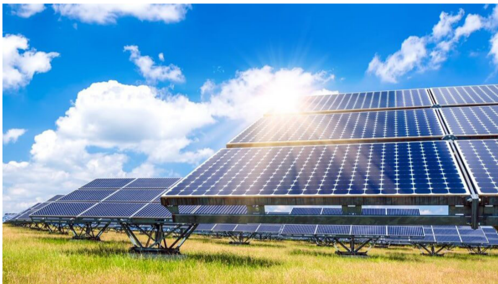
"The National University of Samoa hopes to be fully renewable energy reliant within the next 3 to 5 years."