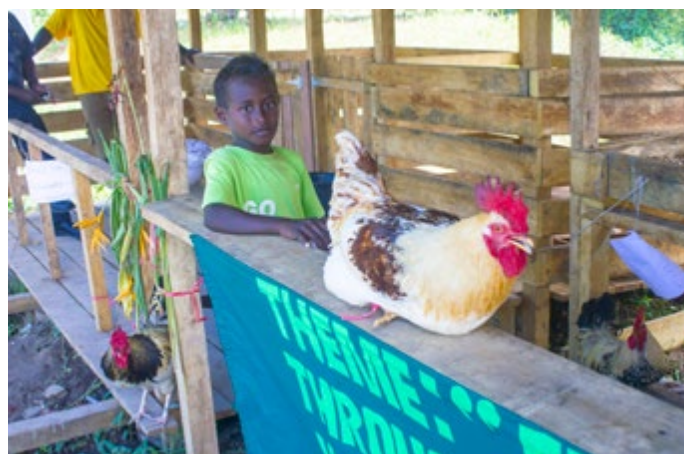
Attracting young and old alike, the 2013 Agriculture and Trade Show was a hit with the public.

The biggest agriculture event of the year was marked in Gizo, Western Province with the staging of the Agriculture and Trade Show from 15-22 June.