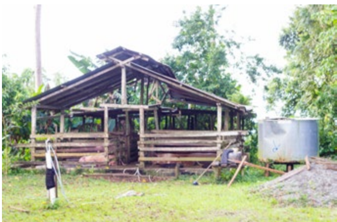
The piggery at Mile 6.