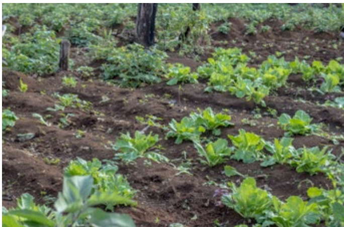
Small crop farming at Mile 6.

MAL's revival of the farm is on track with the two projects