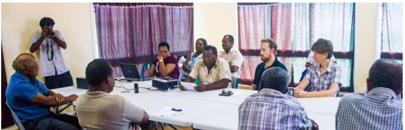
The launching of Quarantine's new database.

"Solomon Islands and Papua New Guinea are known as the bridge into the South Pacific sub-region, any pest or diseases that come down from Asia, usually comes through us before reaching our neighbouring countries. Therefore it is vital that we have plant protection capabilities in place. especially at our entry and exit points." ●