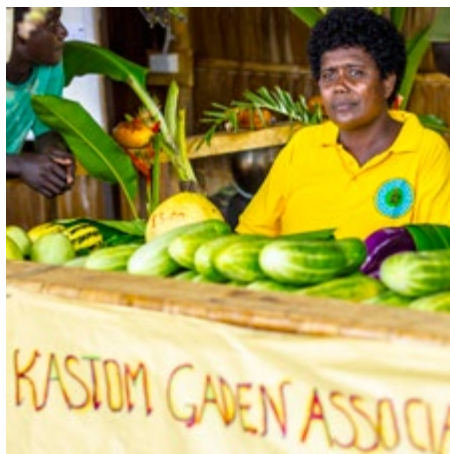
KGA showcase their organically grown produce at the Agriculture and Trade Show.