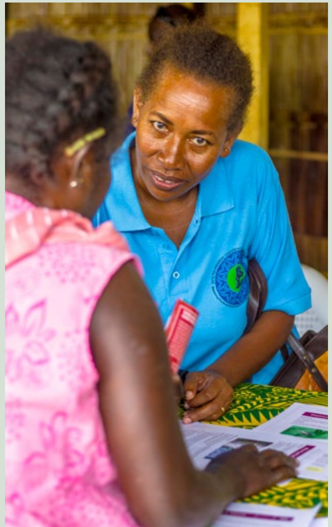
Face to face consultations, MAL staff talk to the public about the benefits of agriculture to their community.