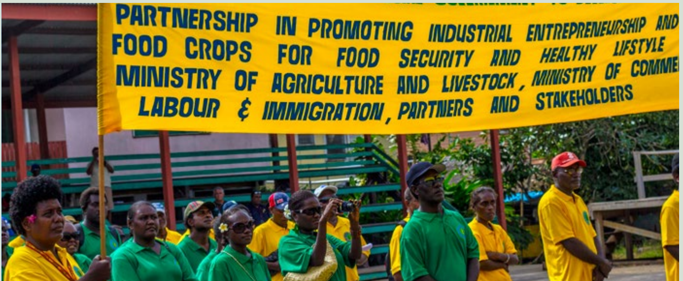
MAL staff on parade at the Agriculture and Trade Show in Gizo.