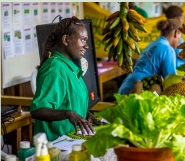
MAL staff showcase agriculture products and services at the Agriculture and Trade Show in Gizo.