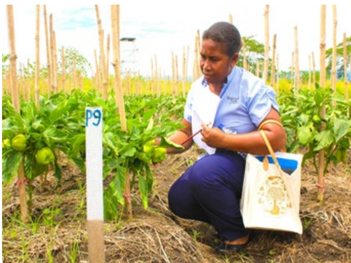
A rep from Heritage Park Hotel assesses the capsicum plants.