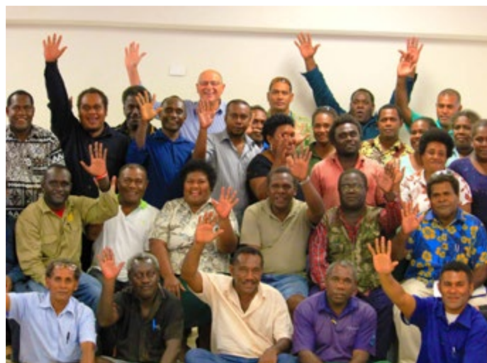
MAL staff at a workshop organised by the Ministry of Public Service.