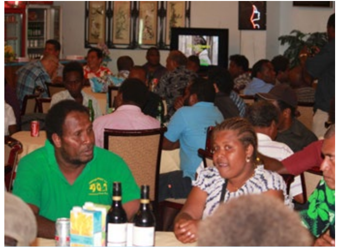
MAL staff and stakeholders farewell Wickham at a dinner at Jina's Restaurant.