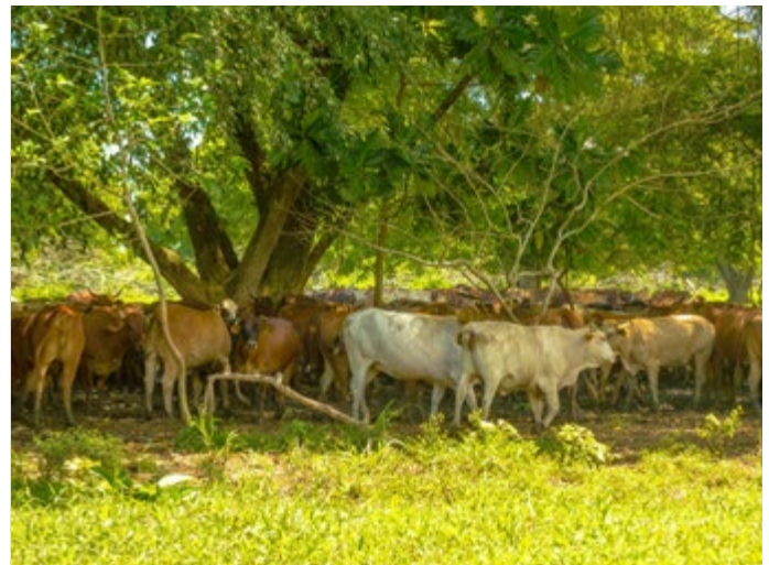
Vanuatu imported cattle at Tenavatu Farm.

"It was important that we set up the channel and ensure that the cattle trade between the two countries would