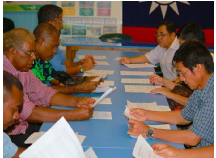
Wickham and MAL senior staff meet with TTM officials.

The Minister highlighted TTM's contribution to the agriculture sector including the introduction of new pig hybrids, new fruit varieties including pawpaw and guava and TTM's assistance in developing the rice sector in the country.