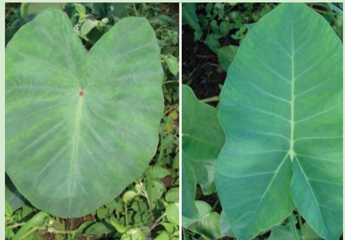
• True Taro leaves

Threats: C. esculenta is more susceptible to pests and diseases than X. sagittifolium . Taro leaf blight, a fungal disease, is a serious problem in some countries, for example, Samoa and therefore resistant varieties must be grown. Leaf eating insects like the hornworm (hawk moth) and armyworm caterpillars can also cause significant leaf damage, if not controlled. Selecting healthy planting material and providing good growing conditions can reduce the occurrence and impact of these pests.