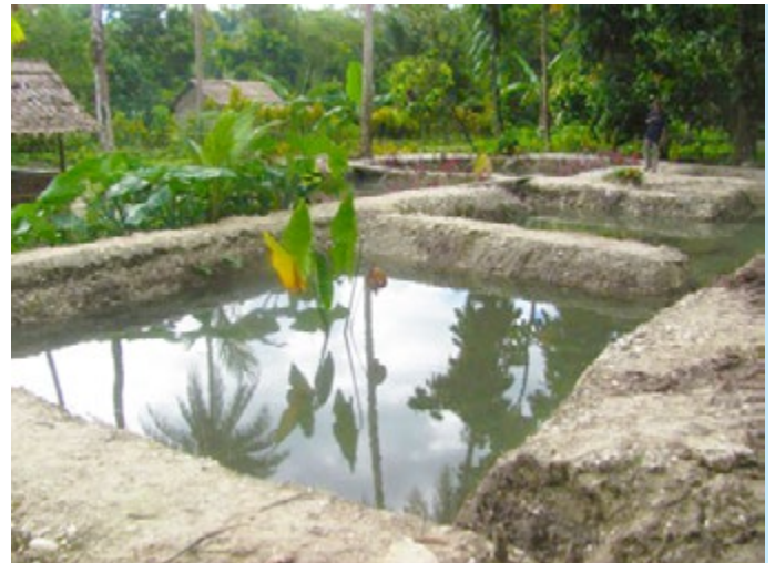
The tilapia ponds.

Roboliu says his future plan is to expand the size of the fish pond and also set up a food bar near the ponds. He