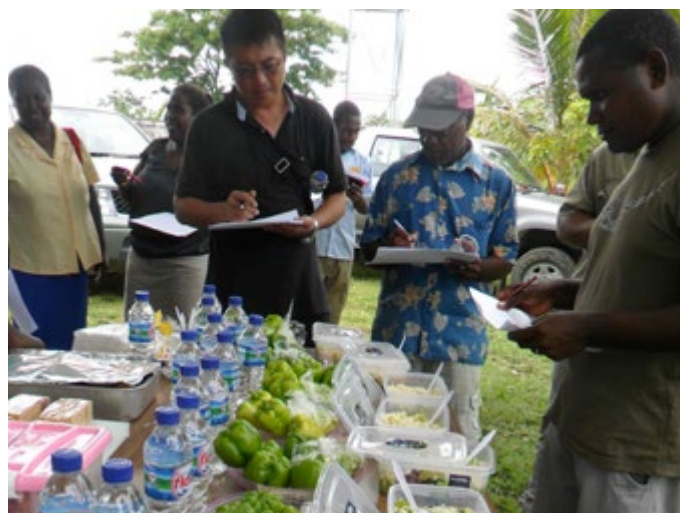
Taste test participants score the capsicum varieties.