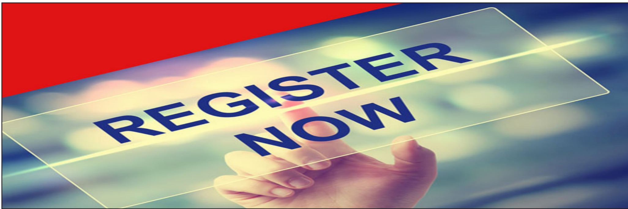
Resitalaina o Sui Tauva o lo'o taofia i atunuu i fafo ona o le Koviti - 19.