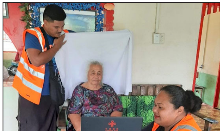
Galuega Resitala a le Ofisa o Faiga Palota, sa fa'agasolo i tua i nu'u ma Itumalo ta'itasi i le atunuu.

Peita'i a o'o i le Palota Tele e le'i mae'a lava iloilogaga, o lona uiga o le a telē le taimi i le uma ai o le Palota, e fa'atino ai aulape o le Tulafono o Faiga Palota, mo le moliaina o i latou e le'i resitala.