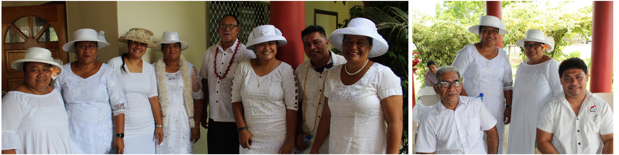
Nisi o alii ma tamaitai faiaoga na auai i le sauniga fa'apitoa.