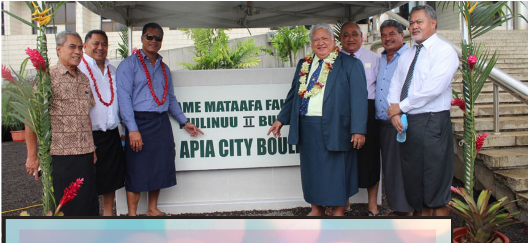
Tatalaina aloaia i le tausaga ua mavae o le Fa'aigoaina ma fa'atuatusiina o auala ma fale i totonu o Samoa.