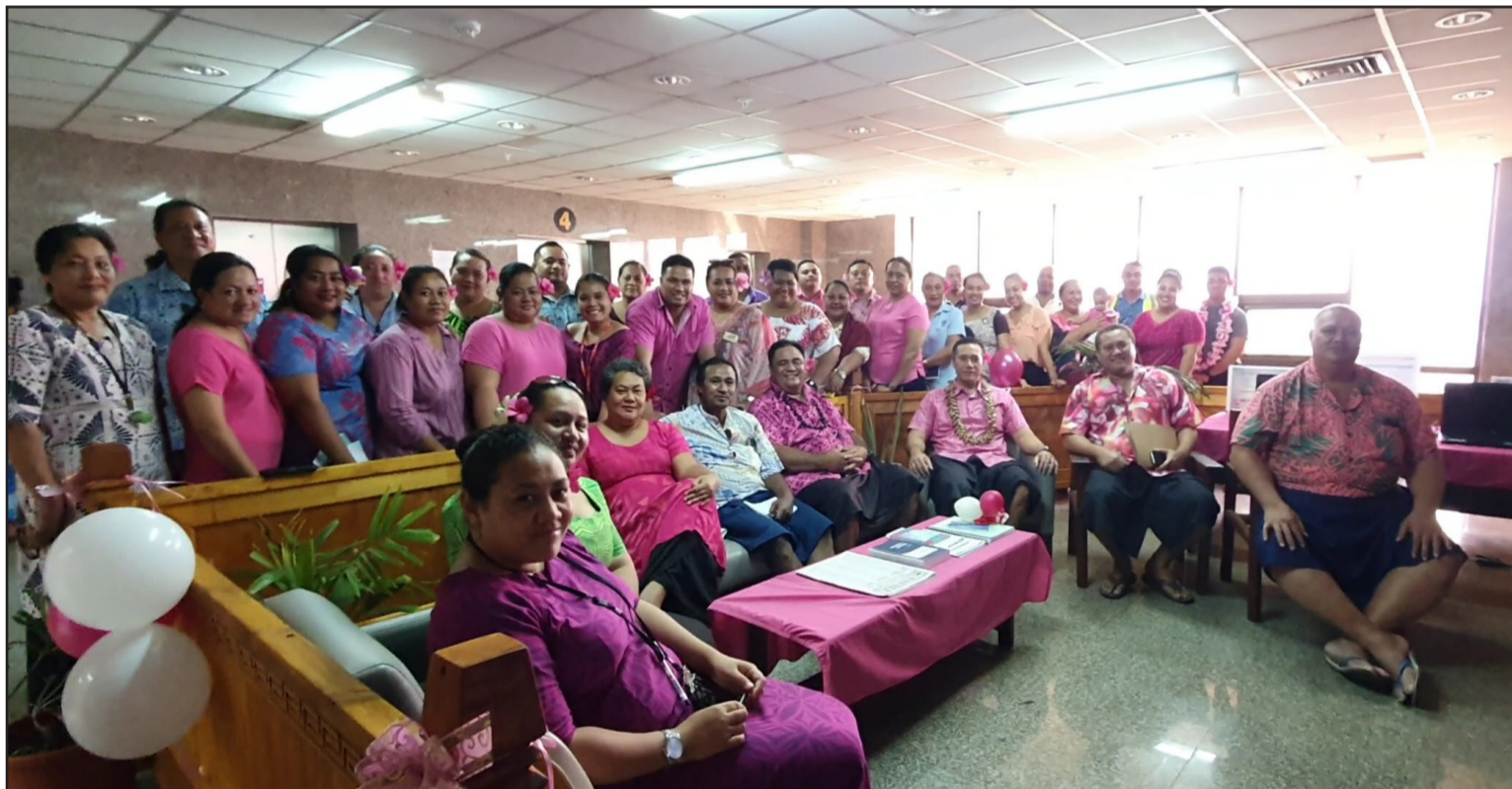
“The Will to Champion the Whole of the Government” The Ministry of the Prime Minister and Cabinet celebrating Public Service Day.