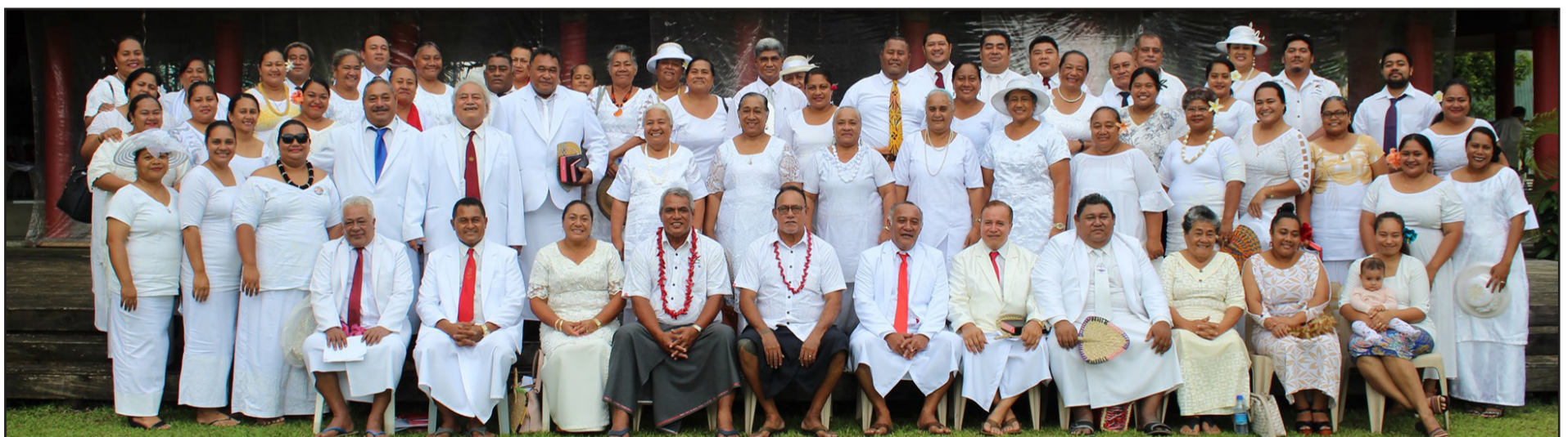
The Teachers council will monitor and support the work of teachers in Samoa as well as improve the production of Teachers locally.