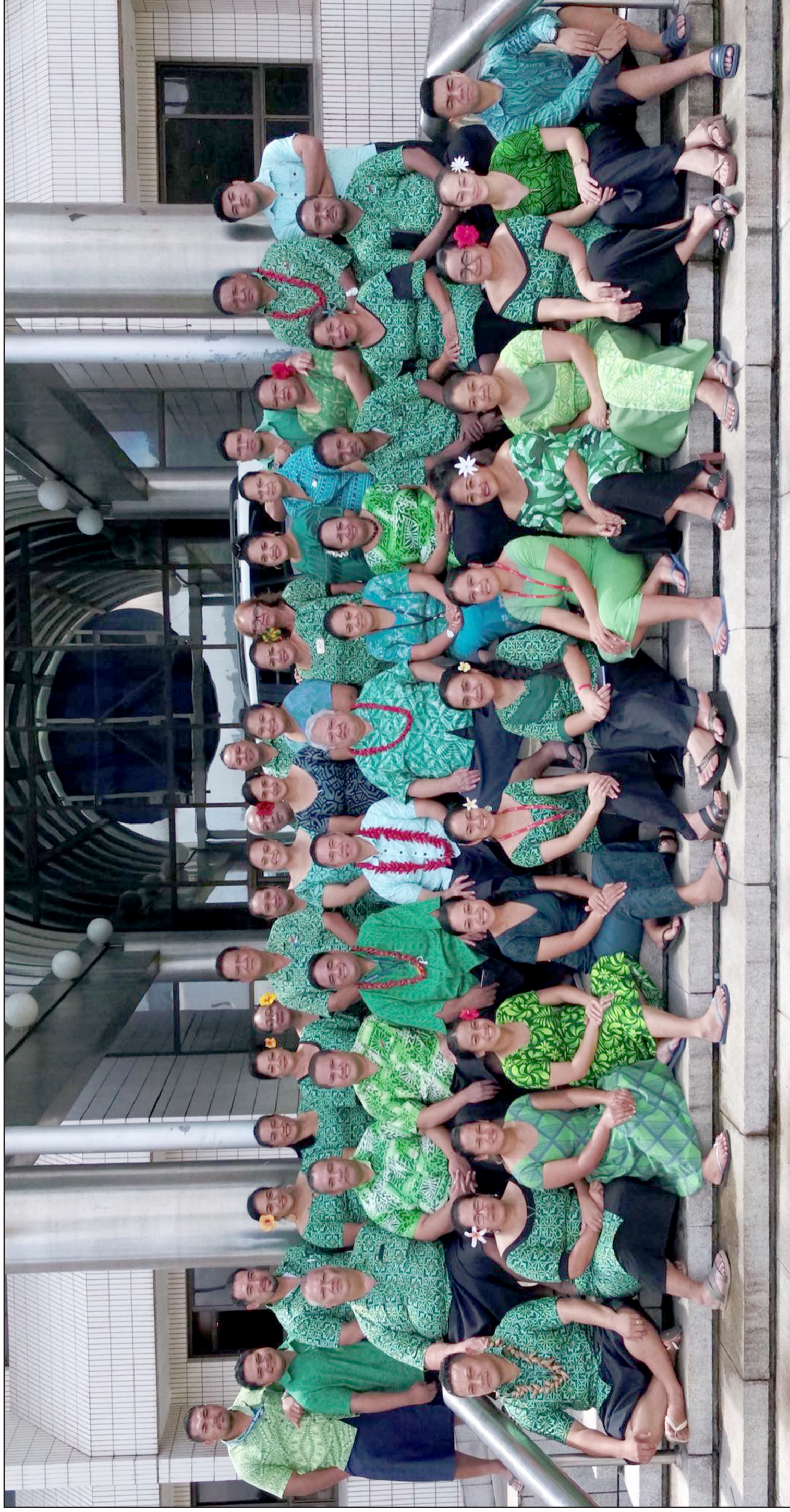
Alofa'aga ma Faamanuiaga: Pulega & Aufaigaluega - Matagaluega a le Palemia ma le Kapeneta