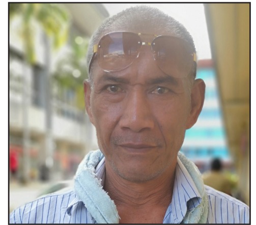
Pula Natu Moe Sama-i-uta/Moata'a 61 tausaga le matua

Ae afai o ai le sui e mafuli i ai le finagalo o se Itumalo, o le tali lena, sa nofo tatalo i ai aiga, ma le itumalo atoa. Auā a silasila fo'i, e leai ma se isi o tatou e silafia lelei uiga o tagata o le a tauva i le faiga palota. E na'o le Atua lava na te silafia le mea o lo'o i totonu o le loto o le sui tauva. O le Atua fo'i, e galue i le loto o le tagata palota, e fa'atino ai lana filifiliga i le sui e tatau ona manumalo e na te tautuaina le Itumalo aemaise o le atunu'u atoa. O le nofo fealofani ma le feoeoea'i o le atunu'u o le vaega pito sili lea ona tāua, auā po'o ai lava e filifilia e fai ma o tatou ta'ita'i, o le agaga atoa ina ia maua ai le fealofani ma le nofo lelei o tatou tagata.