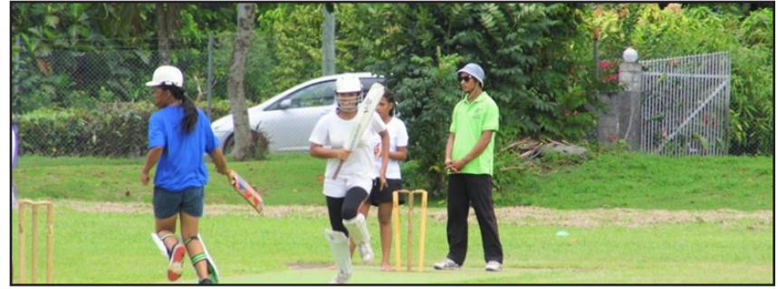
Fa'agasolo ta'amilosaga Kirikiti palagi fa'avāomalō mo fanau laiti i le atunuu

"Faafetai i le Malo mo nei auala ua matou 'ae'ae ai nei. Leaga le mea manaia na o le oso lava i luga o le taavale faalogologo loa i le malu o le savili."