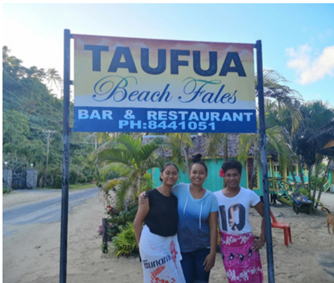
Nisi o le auaigaluega a le Taufua.

Na faaalai e le pule o le Taufua Beach Fales, Taufua Sili Apelu, ua pa'ū maualalo le numera o tagata tafafao i le latou mataaga, ma ua silia ma le $600,000 le tupe ua le mafai ona maua i le taimi lenei o le faama'i.