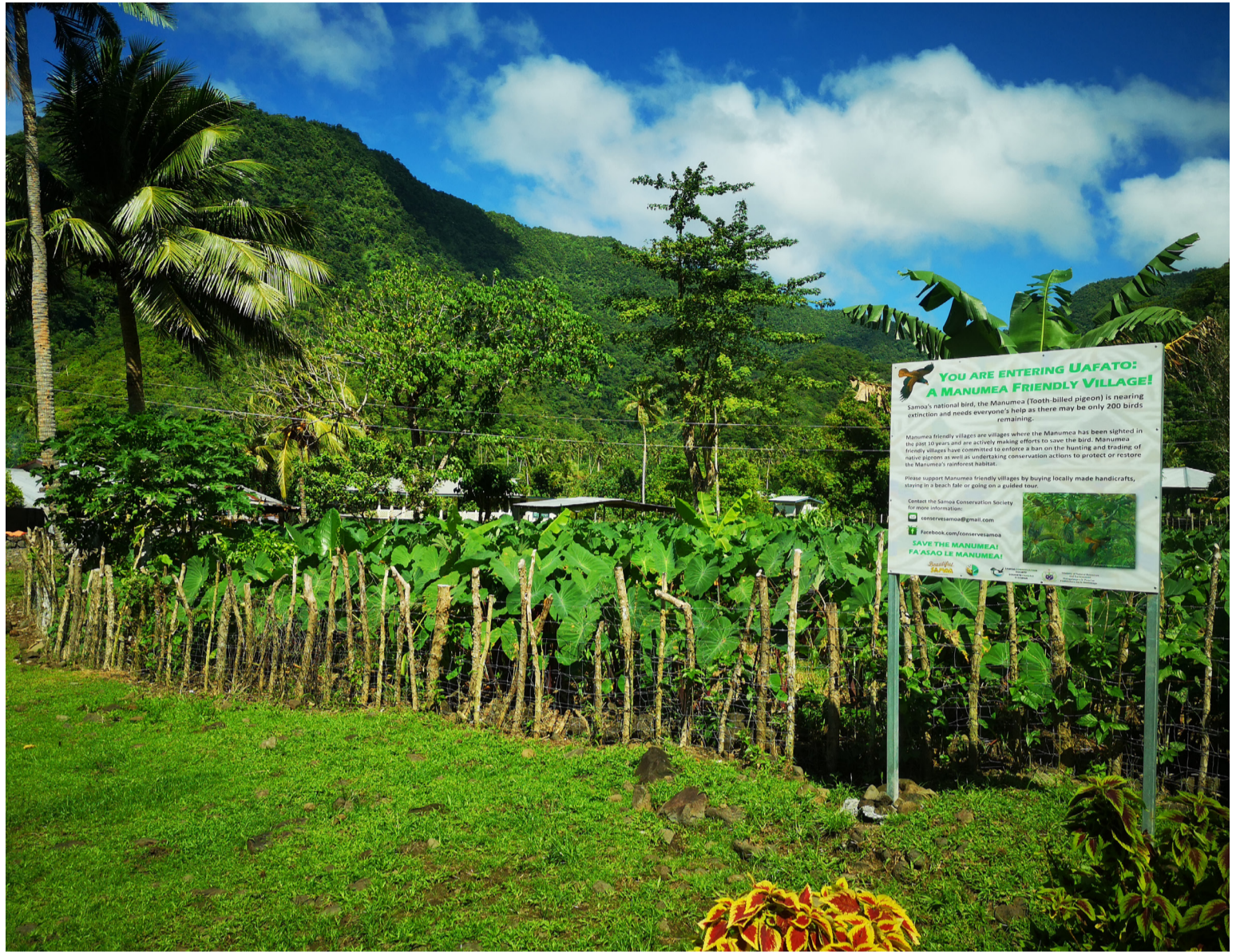
The village of Uafato Fagaloa.