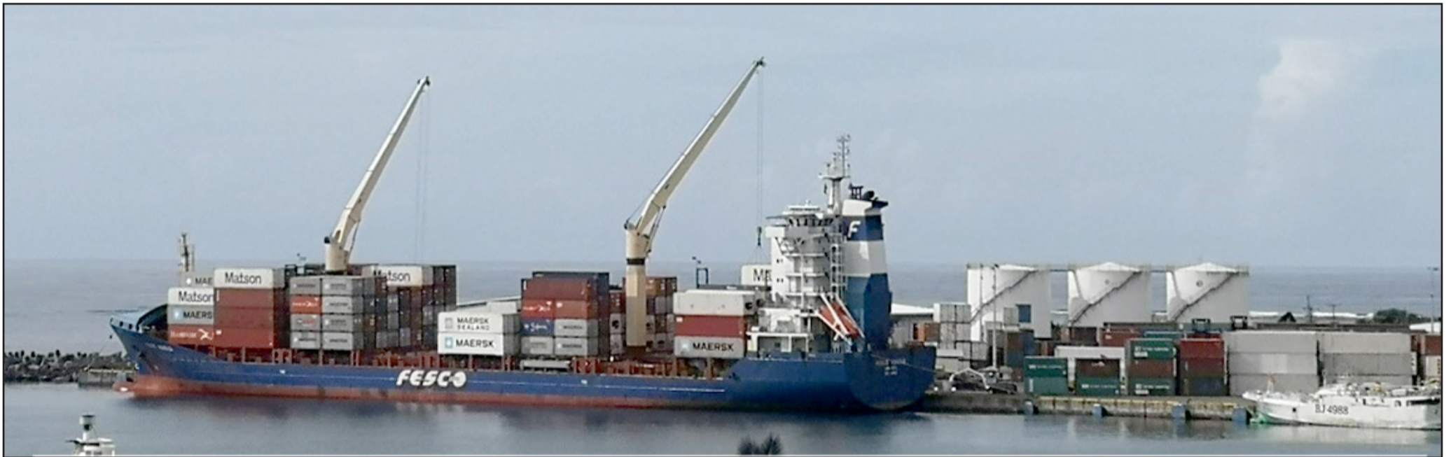
Le va'a la'uoloa ua toai taunu'u ai i le uafu i Matautu, o lo'o aumaia ai le uta o pusa moa ma nisi o taumafa tu'u a'isa mo le fofoga taumafa o le atunuu.