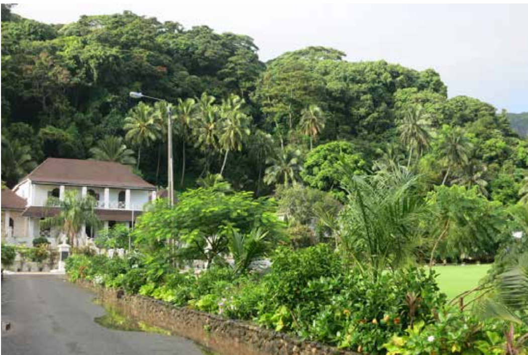
(left) Takamoa Theological College, Rarotonga.

I would like to extend my thanks to the many Cook Islanders who assisted me and made me feel so welcome throughout my visit.