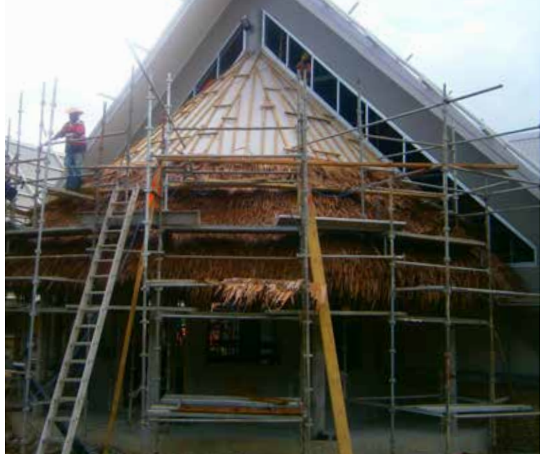
(above) Vanuatu National Archive building picture