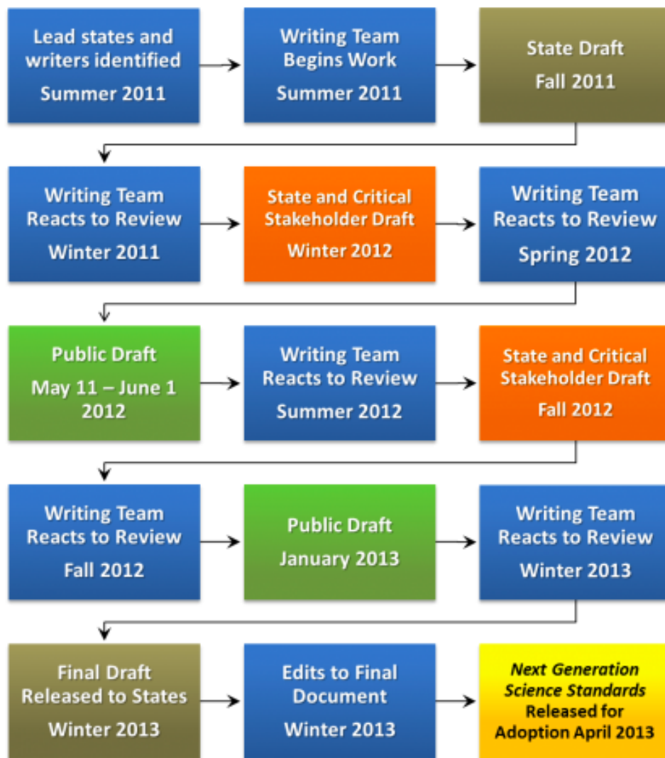
Figure 1: Visual representation of the second stage of the NGSS completion process (NGSS Lead States, 2013).

The Next Generation Science Standards is the result of collaborative inquiry and a structured, deliberate process supported by the National Research Council of the National Academy of the Sciences (NRC), National Science Teachers Association (NSTA), American Association for the Advancement of Science (AAAS), and Achieve (Robelen, 2012). Specifically, these groups completed a two-stage process to create these standards. First, the NRC drafted a preliminary framework by identifying science content that every K-12 student should know and grounding potential avenues of academic inquiry in the most up-to-date research (Branch, 2013; NGSS Lead States, 2013).