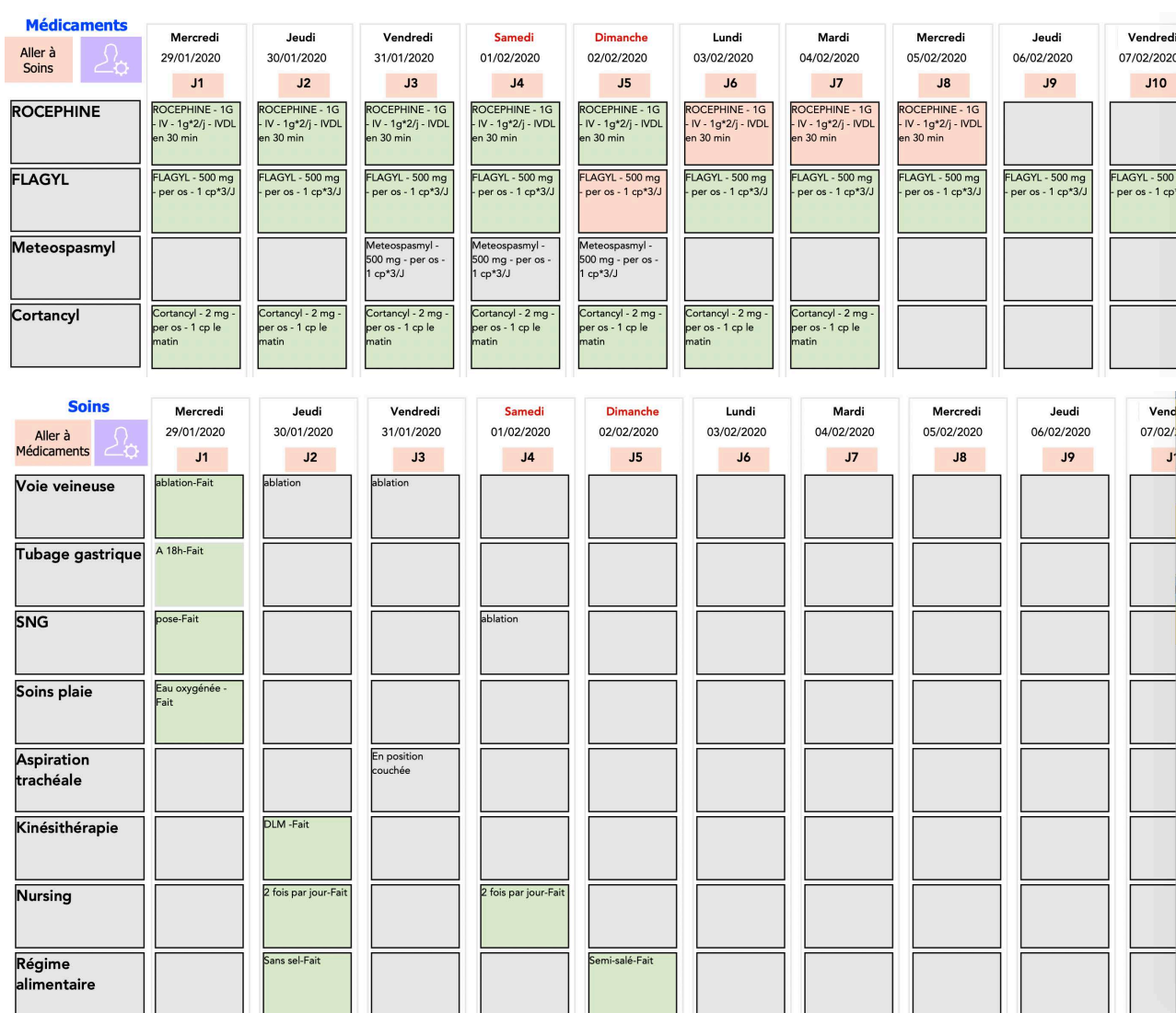
Figure 2. Chart displaying drug administration and nursing.

Components of a patient's nursing record include progress notes, medication charts, laboratory orders and reports, vital signs, observation charts, drug admission and patient's assessment forms.