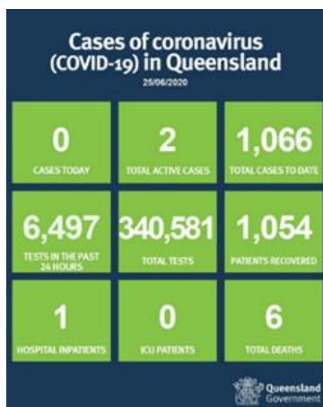
FIGURE 2: DAILY FACEBOOK POST [20]

Platforms such as Twitter have been active sharers of information and COVID related research. [22] Controversy and debate have emerged over mask wearing and new evidence reviews have been promoted on Twitter. [23] #Masks4all.org.uk was established by more than one hundred doctors to promote the wearing of home-made masks to reduce direct transmission and environmental contamination. This group is active on Twitter, Instagram and Facebook and share the emerging evidence on masks.[24]