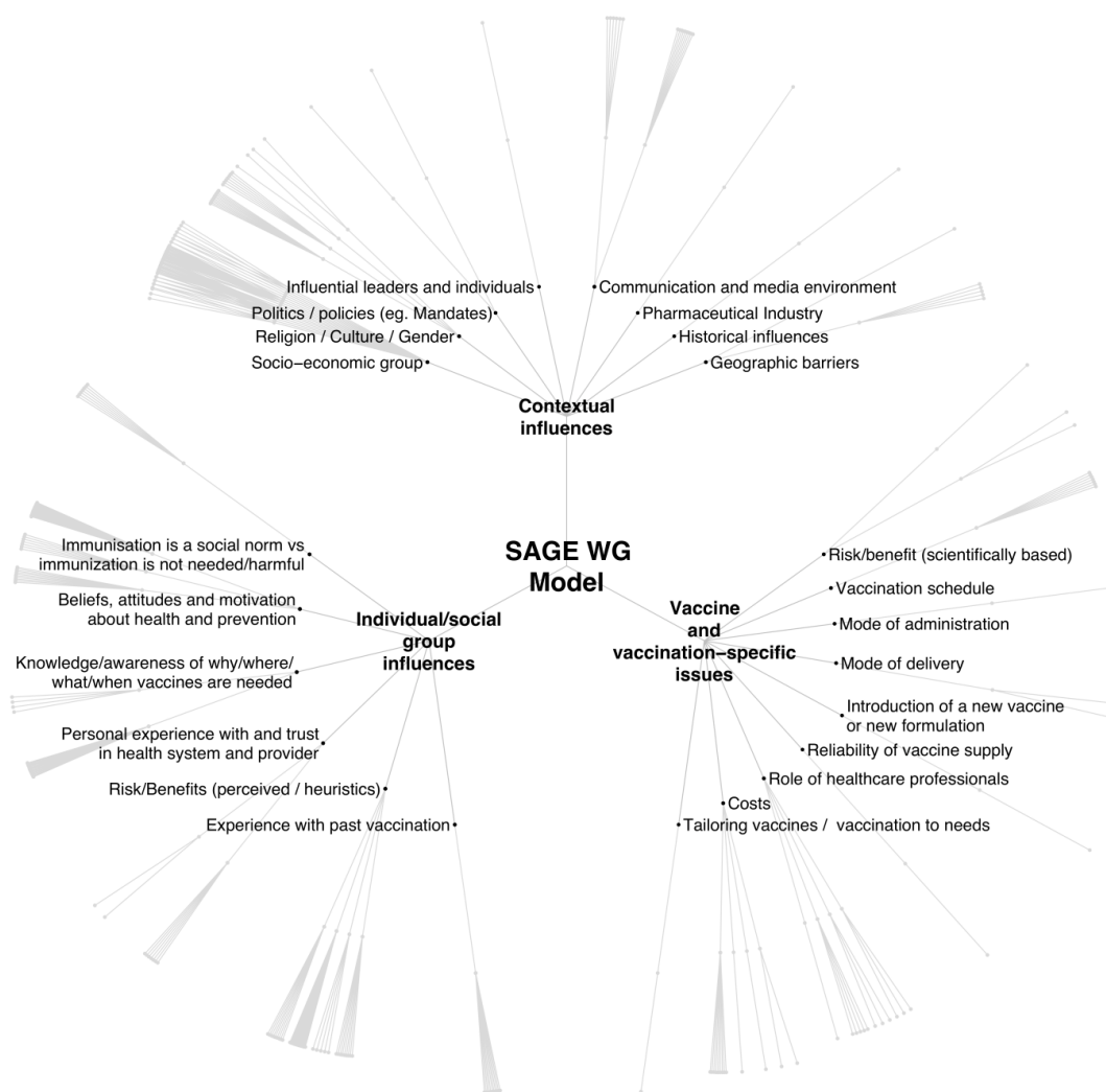
Figure 1. Overview of SAGE Working Group (WG) “Model of determinants of Vaccine Hesitancy” (source: Larson et al. Vaccine 2014; 32, 2150-9).

The instrument used for data collection was adapted from the model developed by the Strategic Advisory Group of Experts Working Group (SAGE WG) for the assessment of the determinants of vaccine hesitancy. This framework is effective and reliable and is commonly used to identify the main determinants of vaccine hesitancy. The SAGE WG framework serves as a standard because it considers the common psychosocial factors that are related to vaccine hesitancy. According to SAGE WG framework, vaccine hesitancy can be assessed under three main arms: a) contextual influences; b) individual/social group influences and c) vaccine and vaccination-specific issues (Figure 1). Some aspect of these arms especially the vaccine and vaccination-specific arm can be evaluated using three domains: confidence, complacency and convenience.