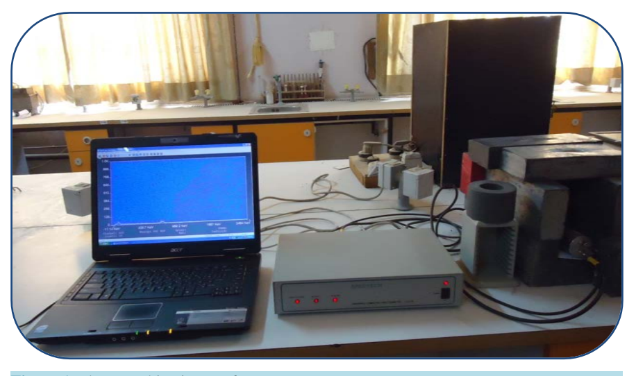
Figure 1. Photographic picture of system measurement.

Also the relationship between attenuation coefficients and the energies is shown in Figure 2.