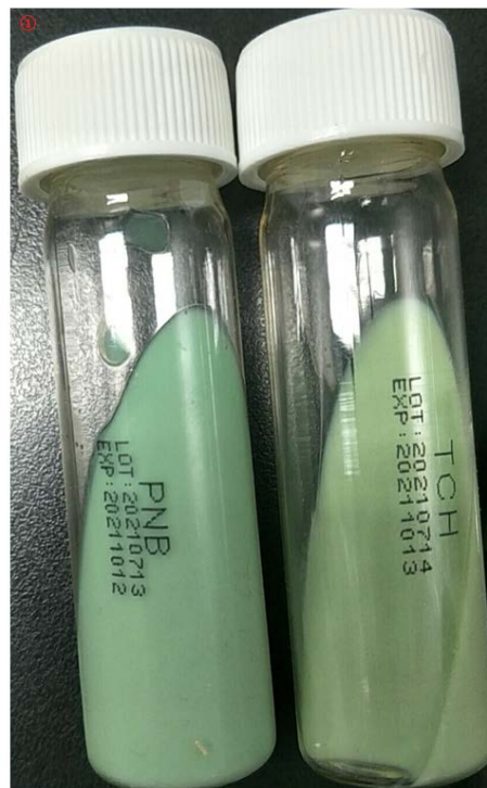
Figure 1. Mycobacterium culture medium.

Common bacteria identification and drug susceptibility equipment adopts the integrated identification and drug susceptibility equipment produced by Hunan Tiandiren Company and French Mérieux Company; Identification and drug sensitivity test of M. tuberculosis were performed by mycobacterium drug susceptibility detection kit (culture method). Drug sensitivity plates and culture tubes are shown below in Figures 1-3 . The reagents use the supporting reagents produced by the equipment manufacturer, and all reagents are used within the validity period.