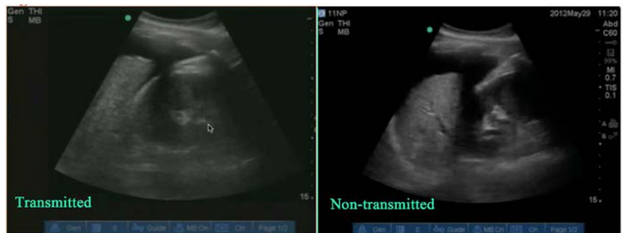
Figure 3. Transmitted vs Non-Transmitted FAST exam. Side by side comparison of transmitted (left) vs. non-transmitted (right) ultrasound images depicting a Fast exam positive for the presence of fluid.

All videos were compressed from their original Digital Imaging and Communications in Medicine (DICOM) format into a Mp4 format that allowed for transmission via third party servers (ex: Skype). Non-transmitted videos were files solely in compressed Mp4 format while transmitted videos also incorporated the possible additional effects of being sent through third party servers. Digital transmissions of ultrasound videos via Skype were paired with the respective non-transmitted originals to produce a total of 144 ultrasound videos (72 pairs). Videos were three seconds in length and had a predetermined diagnosis that was designated as the gold standard diagnosis of the study.