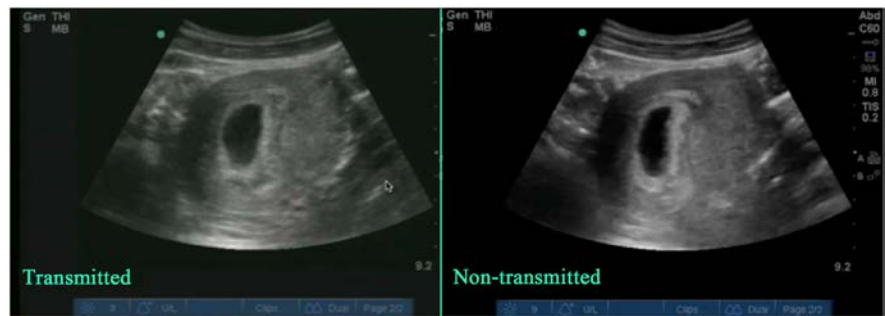
Figure 2. Transmitted vs Non-Transmitted IUP exam. Side by side comparison of transmitted (left) vs. non-transmitted (right) ultrasound images depicting an intrauterine pregnancy.