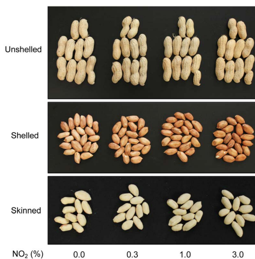
Figure 3. Effects of NO 2 fumigation on visual appearance of unshelled, shelled, and skinned peanuts. Unpasteurized, unshelled peanuts were fumigated with 0.3%, 1.0%, and 3.0% of NO 2 for three days at 25°C.

Fungi are associated with peanuts through seed development, harvesting, and storage of peanuts, and they often cause poor germination, mustiness, and mycotoxin contamination [28]. Storage fungi on peanuts include species of Aspergillus , Penicillium , Rhizopus , and Fusarium [29]. Aspergillus flavus is most important among them due to its carcinogenic aflatoxin production. Almost complete control of all bacteria and fungi were achieved in the current study. Therefore, it is reasonable to assume that NO 2 fumigation is effective against all major fungal contaminants listed above. However, these encouraging results were based on small laboratory fumigation tests. Larger-scale fumigation tests are needed to verify efficacy of small laboratory fumigations and develop practical NO 2 fumigation tests.