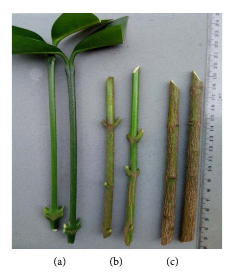
Figure 1. Different types of Garcinia kola cuttings used for propagation; greenwood leafy cuttings with 25% of leaf area (28.5 cm<sup>2</sup>) (a), softwood leafless cuttings (b), hardwood leafless cuttings (c).

Two factors were tested 1) the cutting type (greenwood, softwood and hardwood) and 2) leaf area (0, 28.25, 56.5, 84.75 and 113 cm<sup>2</sup>). Fifteen treatments were applied (3 cutting types \times 5 leaf areas). For each treatment, 60 cuttings were arranged in three replicates (20 cuttings per replicate). Cuttings were inserted to a depth of 3 cm in the rooting media with a spacing of 5 cm from eacth other ( Figure 2 ). After planting, cuttings were watered and the non-mist poly-propagator was covered with clear polythene to maintain high humidity around the cuttings and allow the penetration of light into the propagator ( Figure 3 ). The average temperature and relative humidity registered in the non-mist poly-propagator were 28°C ± 2°C and 94%, respectively. The cuttings were sprayed with a fine mist of water once per week because of the high moisture content in this non-mist poly-propagator.