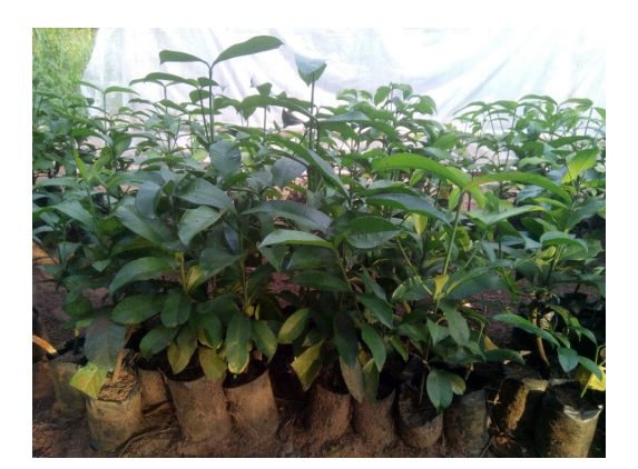
Figure 5. Seedlings of G. kola regenerated in non-mist poly-propagator by stem cuttings and acclimatized in shade nursery.

ability due to their more food reserves in these cuttings. According to [38], the sprouting of cutting depends on food reserves available within the cuttings in vegetative propagation.