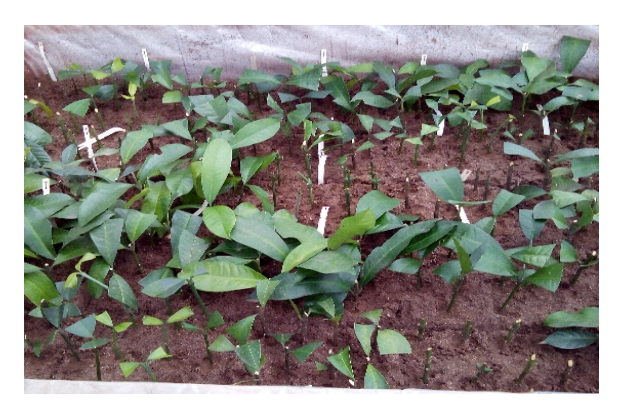
Figure 2. Unrooted cuttings of Garcinia kola planted in non-mist poly-propagator.

Figure 1. Different types of Garcinia kola cuttings used for propagation; greenwood leafy cuttings with 25% of leaf area (28.5 cm<sup>2</sup>) (a), softwood leafless cuttings (b), hardwood leafless cuttings (c).