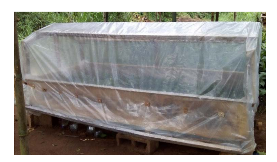
Figure 3. Closed non-mist poly-propagator containing cuttings and placed under shade.

Over a period of 180 days after planting the cuttings, assessments were made on cuttings viability percentage (cuttings remained green and alive, or dead); the percentage of sprouting and rooting, the sprouting and leafing emergence time, the number of primary roots, the length of shoot and the longest root per cutting. Cuttings were considered rooted or sprouted when they have one root or bud exceeding 0.5 cm in length. To facilitate rooting evaluation, rooted cuttings were taken from substrate carefully and sand was removed. Sprouting was assessed every two days, while rooting was assessed at monthly intervals. Final mean data/percentages were calculated at the end of the experiment.