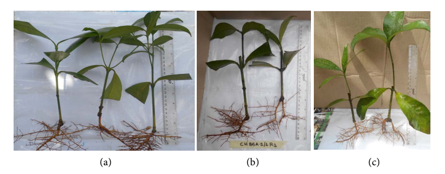
Figure 4. Rooted Garcinia kola cuttings: (a) greenwood rooted cuttings with 56.5 cm<sup>2</sup> leaf area; (b) softwood rooted cuttings with 56.5 cm<sup>2</sup> leaf area and (c) hardwood rooted cuttings with 113 cm<sup>2</sup> leaf area.

Rooted cuttings transferred under shade nursery for acclimation presented 100% survival percentage and growth in nursery during 18 months (Figure 5).