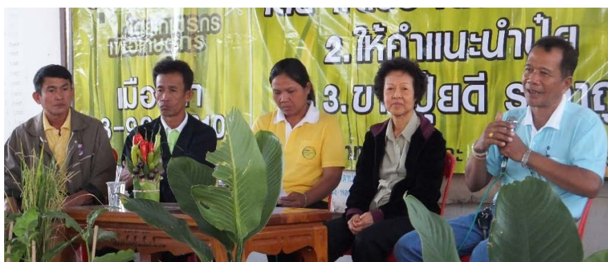
Figure 5. Farmer leaders sharing experiences from using TFT in rice production on January 18, 2015.

waiting for the results of soil analysis, they can attend a learning forum described above. Then, after lunch, the results of soil analysis with the fertilizer recommendation are presented and discussed with the farmers ( Figure 6 ).