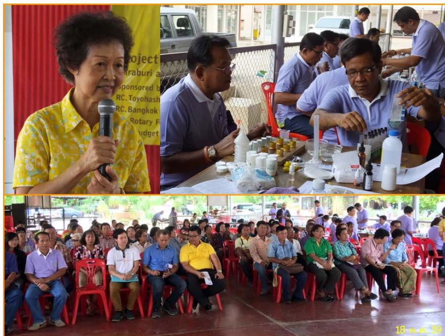
Figure 4. Learning forum of farmers on May 18, 2015.