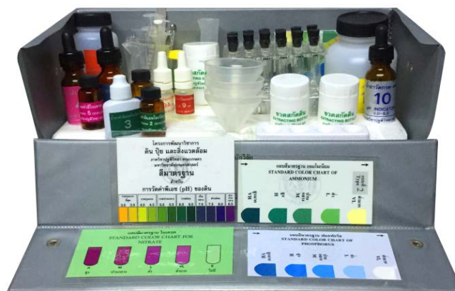
Figure 1. KU soil test kit.

farmland. In 2002 a practical handbook was developed for identifying soil series that enabled extension officers and farmer leaders to identify the soil series by themselves. Subsequently, the developed procedure was published [4]. It is sometimes more convenient to use existing soil series maps at sub-district level as a simple visual tool (Figure 2).