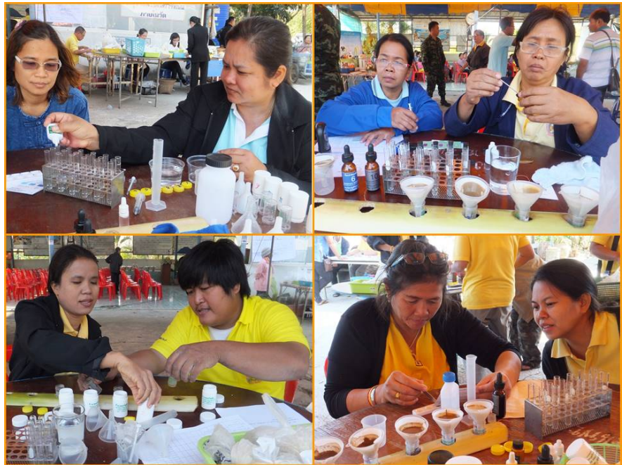
Figure 6. Soil analysis is provided to farmers by farmer leaders on January 18, 2015.