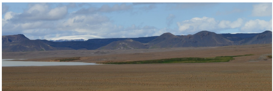
Figure 1. Example of degraded communal areas in Iceland. Vegetation remnants in a barren “desert” area at 2 - 300 m elevation. A 1 - 2 m thick fertile Andosol has been fully removed by erosion by wind and water, leaving the barren gravelly surface behind. The lower elevations of this area were fully covered with birch woodlands and harvested for fuel-wood into the 1600’s. The degradation was land-use driven. The area is a common and continues to be grazed by sheep. Birch woodlands can be returned to areas like these by strategic restoration efforts [9] Photo: O. Arnalds 2018.

A large proportion of the highland communal areas used for grazing have limited vegetation cover and have been subjected to severe ecosystem collapse since the arrival of man to Iceland around 870 [3]. The remaining vegetation is often in poor condition (Figure 1). The commons with the least vegetation cover