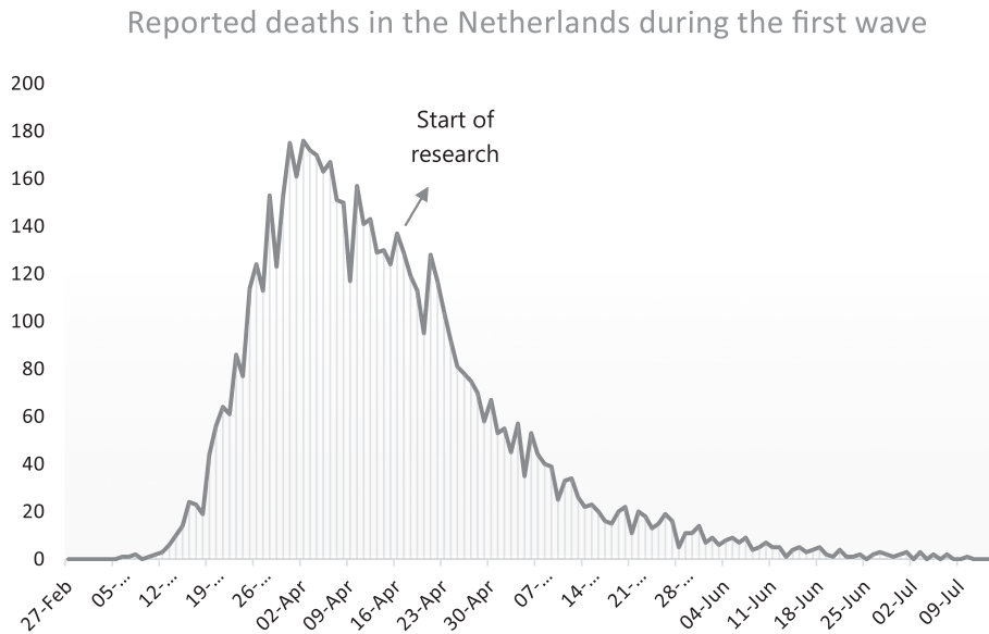
Figure 1: Number of deaths due to COVID-19 reported by municipal and regional health services by date (RIVM 1 July 2020)