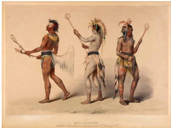
Figure 1. Ball Players. George Catlin. Date unknown.

American Indians are thought to have founded the modern game of lacrosse, as well as other stick games. Lacrosse, which received its name from French settlers, was more than a form of recreation. It was a cultural event used to settle disputes between tribes.